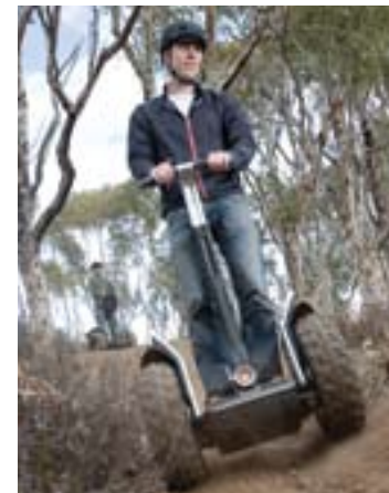
Segway 5W LED Headlamp

An x2 equipped with the Adventure package is an off-road machine that's ready to go. Included are a handlebar bag for water bottles and tools, an accessory bar, a Segway 5W LED headlamp, universal cargo plates for gear, and a LeanSteer frame tool-less release for easy transport and storage.