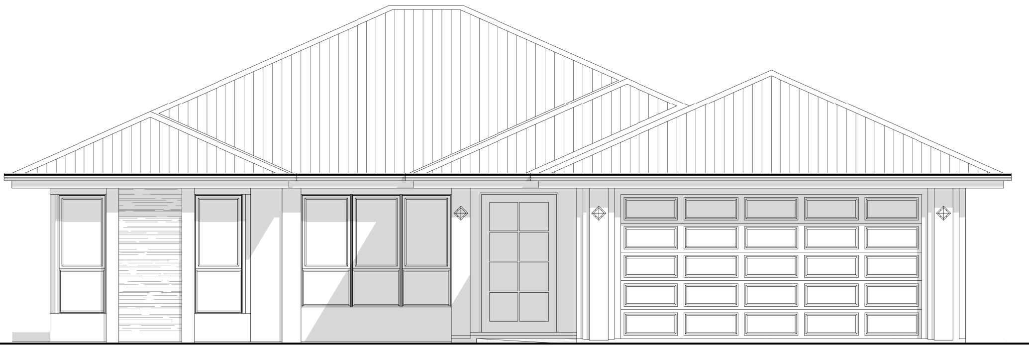
ELEVATION - Front